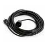
Practical 15 m power cord.