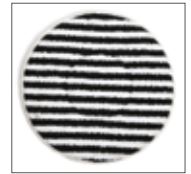
Microfiber-polyester carpet pad.