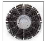
PBT washing brush.