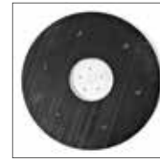
Full Velcro pad driver.