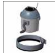
Suction kit with vacuum cleaner and dust guard.

Changes the orbital speed from 1400 to 2800 oscillations per minute, the correct speed for dry polishing and floor crystallization treatments.