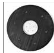
Full Velcro pad driver.