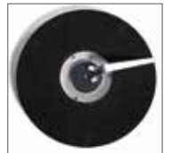
Pad driver for sandpaper.