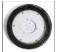
Nylon washing brush.