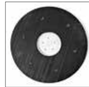
Full Velcro pad driver.