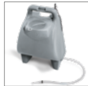
15 liter polyethylene tank.