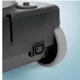
Additional electrical socket.