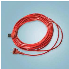
Untwistable, high visibility cable.