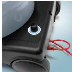
Power regulator to reduce the noise level.