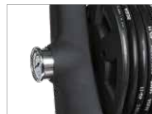
PROFESSIONAL GAUGE (only for I1508 A0-M - I1610 A0-M)