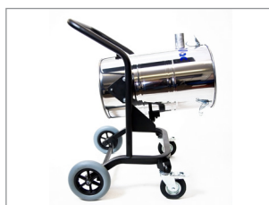
SOLID CART WITH TIPPING TANK