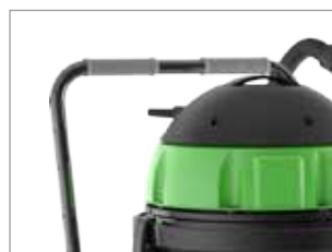
TROLLEY WITH HANDLE