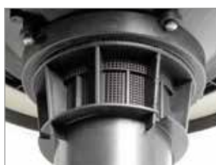
INTEGRATED ANTI-FOAM SYSTEM