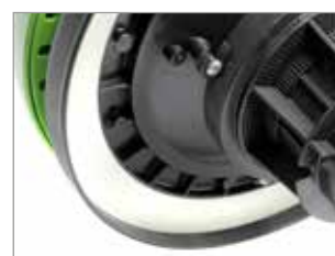
INNOVATIVE HEAD GASKET