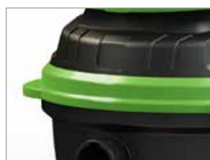
SIDE PROTECTION AGAINST DOORS AND WALLS