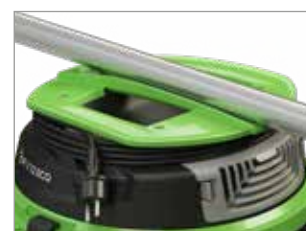
ERGONOMIC HANDLE WITH INTEGRATED CABLE WRAP